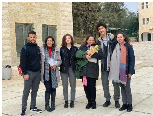
Student Council and Middle School Library celebrated International Women's Day

As the first school for girls in Ramallah, and a pillar of gender equality and women's rights in Palestine. RFS community celebrated International Women's Day and Palestinian Mother Day during March in various ways.*