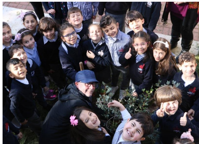
Click on the photo to watch our Tree Planting video